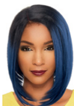
VANILLA SPOTLIGHT 101 SYNTHETIC Tongable Lace Parting