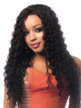
FLAUNT SPOTLIGHT 101 SYNTHETIC Tongable Lace Parting