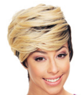
DINA - FASHION IDOL 101 PREMIUM SYNTHETIC, Tongable Wig