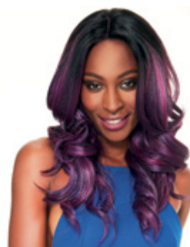
RUBY SPOTLIGHT 101 SYNTHETIC, Tongable Lace Free 4x4" Parting