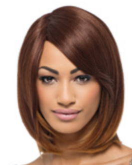
KIARA WIG - FASHION IDOL 101 PREMIUM SYNTHETIC, Tongable Wig