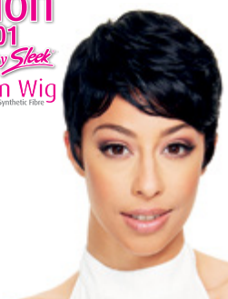
BO - FASHION IDOL 101 PREMIUM SYNTHETIC, Multi-feature, Tongable Wig

fashion idol 101 by Sleek Premium Wig 100% Premium Tongable Synthetic Fiber