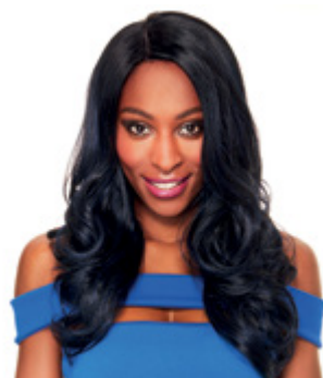
OPAL SPOTLIGHT 101 SYNTHETIC, Tongable Lace Free 4x4" Parting