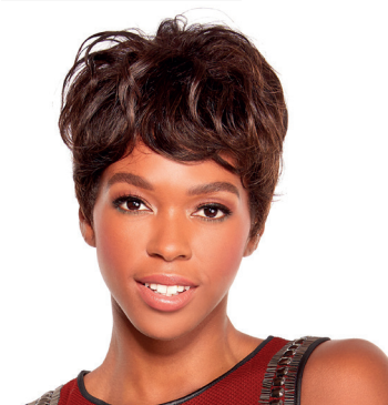
JACKIE - WIG FASHION HUMAN HAIR