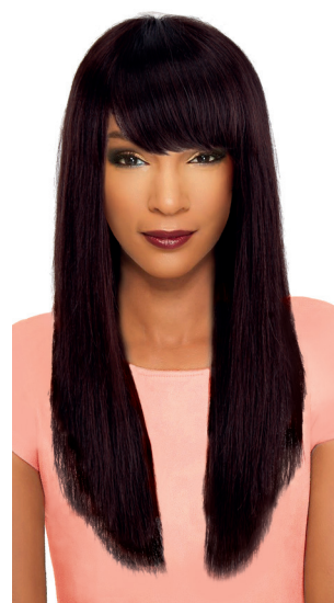
LOTUS SPOTLIGHT HUMAN HAIR, Lace Parting