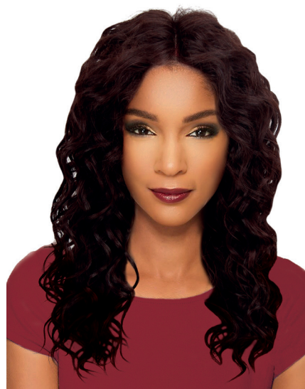
CLOVER - SPOTLIGHT HUMAN HAIR Lace Parting