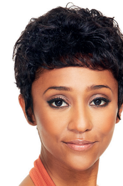
NICOLE - WIG FASHION HUMAN HAIR