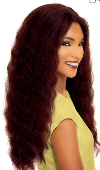
POPPY SPOTLIGHT HUMAN HAIR, Lace Parting